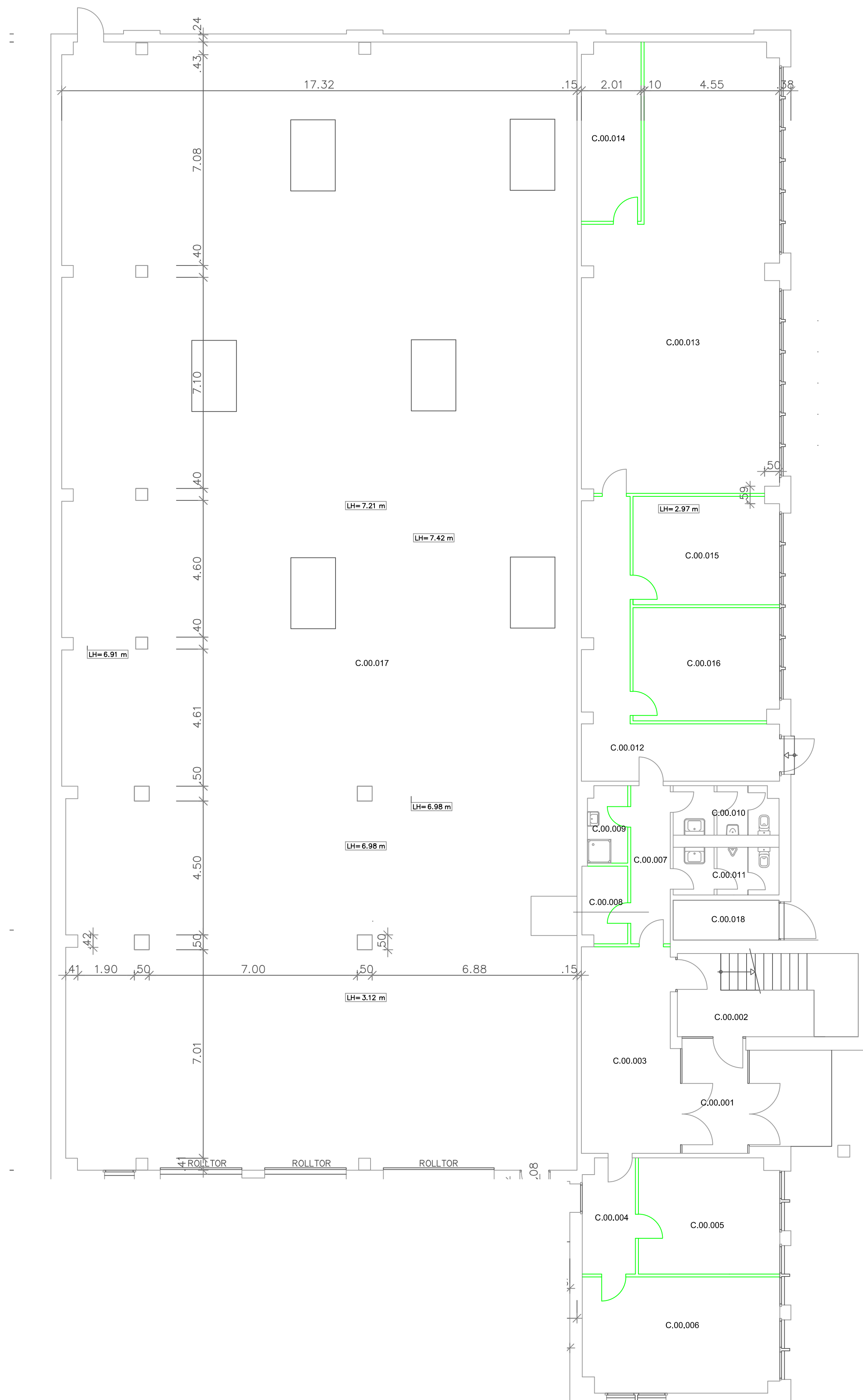
GRUNDRISS Bauteil C-EG M. 1:100